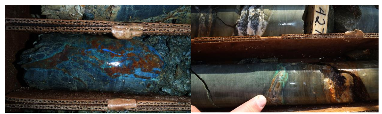
MM-18: Azurite at 103 feet

These historic core holes contained several near-surface copper oxide/enriched intervals that with azurite, malachite, chalcocite, and chrysocolla.